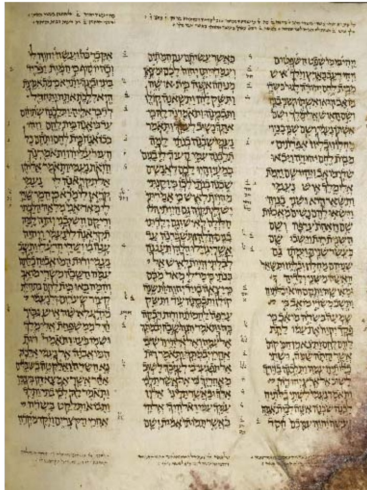
Ruth 1, the Aleppo Codex (10th c. C.E.)